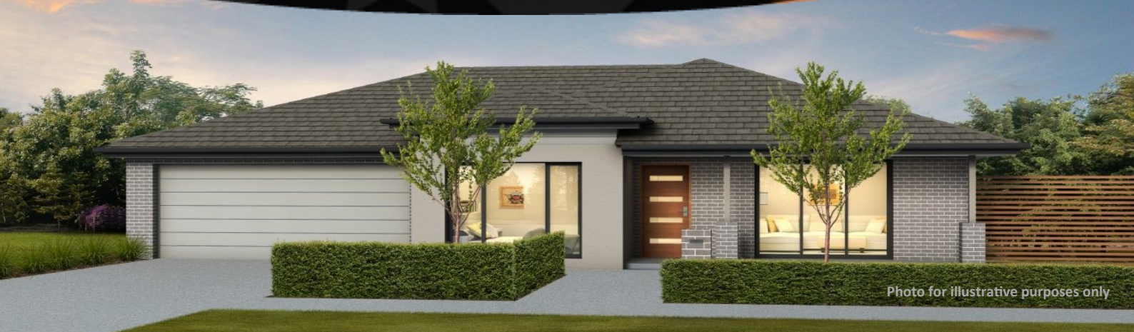
Photo for illustrative purposes only